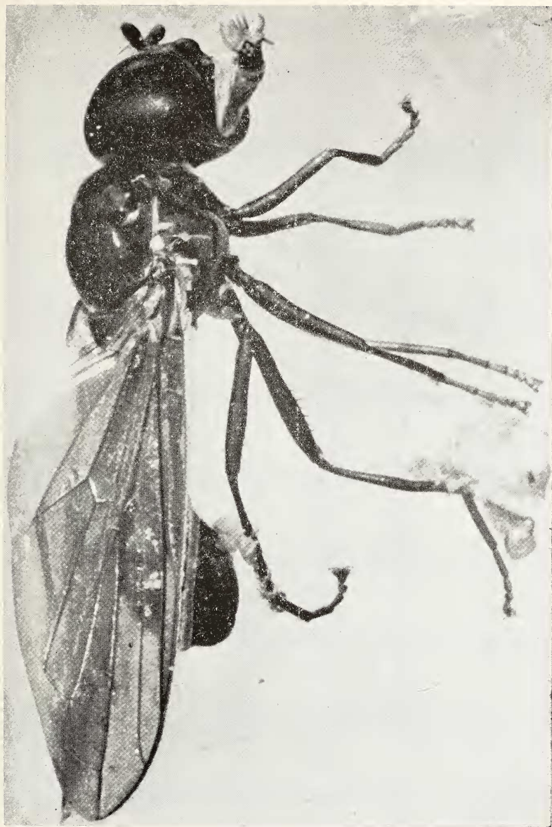
PLATE 3. HULL — PSEUDOSPHEGINA CARPENTERI